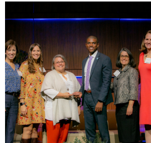
Health Extension for Diabetes Recipient of the State Impact Award

The State Impact Award recognizes a state level organization or coalition that demonstrates a commitment to support and takes action under the Live Healthy plan, using a collaborative approach for state health improvement. This year's recipient is Health Extension for Diabetes (HED) – Clemson University . HED is a free education program that offers lessons on chronic disease self-management for people diagnosed with diabetes.