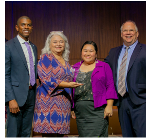
Palmetto Project Recipient of the Community Innovation Award

The Community Innovation Award recognizes a community coalition or community-based organization that demonstrates active engagement in leading and guiding innovative work for community health improvement and the elimination of health disparities. This year's recipient is Palmetto Project . Palmetto Project's mission is to identify innovative strategies to address the social and economic challenges facing our state and put them into action.